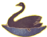
Old design State Guide badge