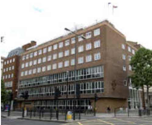
Baden-Powell House, London (B-P House)